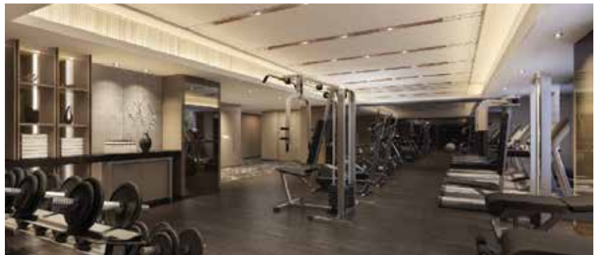
24/7 Gym & Yoga Room

Guests can also expect top-notch facilities and services that cater to both business and recreational needs. Meeting spaces are equipped with the latest conferencing capabilities, complimentary high-speed Internet and flexible configurations. Lifestyle and wellness amenities include a 24/7 gym, golf simulator, and relaxation space with massage chairs. The All-Day Dining restaurant serves a curated menu that showcase fresh, seasonal fare for a delicious start or end to your day.