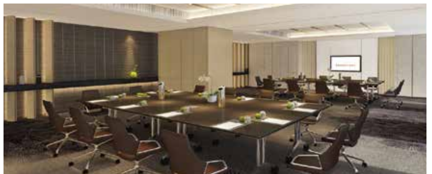
Meeting & Conference Facilities