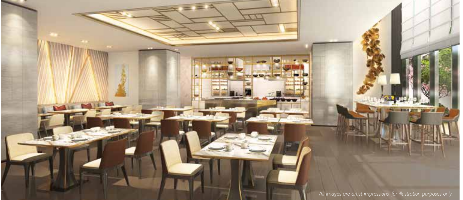
All images are artist impressions, for illustration purposes only.